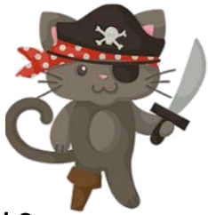
Cat Costume Contest!