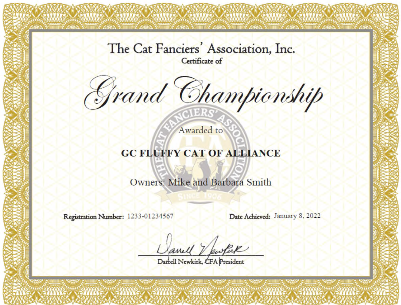
Example of new Grand Certificate