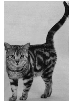
GC Sandef's Robt. E. Lee, DM

Sandef's Robt. E. Lee's mother, CH Sandef's Ghost, was a gorgeous girl. In "Ghost's" last litter there were three outstanding kittens: CH Miribu's Molly Pitcher, Sandef's Ulysses S. Grant