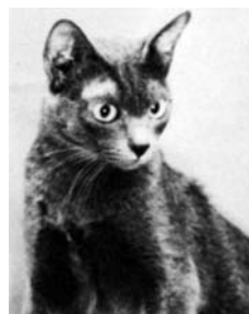
GC Jena Tu-Thai, DM

Not only was Poppy the first Longhair Japanese Bobtail DM, she produced two DM children including the first male Longhair Division DM, GC, BW Kurisumasu Ki-ito, DM, and her granddaughter, GC, GP, RW Kurisumasu Shobi, DM, has 14 grands. In addition to these cats, Poppy is behind nine breed winners (Best or Second Best of Breed) in the Longhair Division. Poppy was always a delight to show and her offspring had the