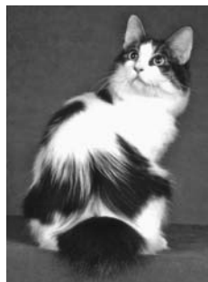
GC, GP, RW Kurisumasu Kohana, DM