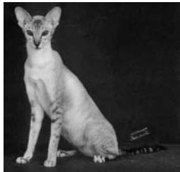
GC Sanlino Prima Linca, DM