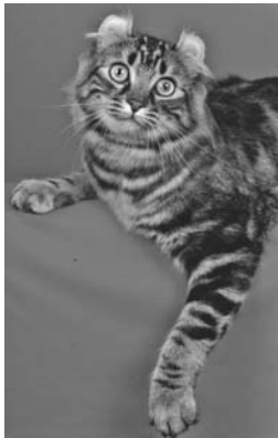
GC, BW, RW Procurlharem Lauren Bacurll, DM