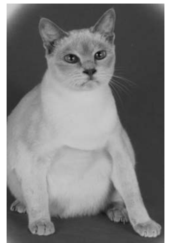
CH Shotoku Mageia, DM