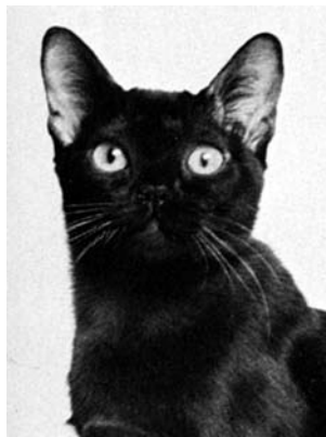
GC, NW Road to Fame's Mabel Black Label, DM