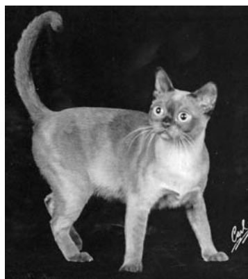
GC, NW Anoka Jolie Blonde, DM