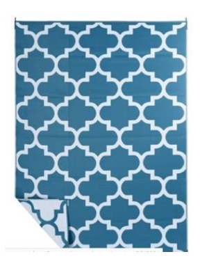
Outdoor 9' x 12' Reversible Patio Rug

Below is an example of a suggested layout up for outdoor rugs