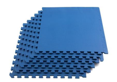
Foam Flooring Tiles

For flooring, some have foam tiles and others used outdoor rug.